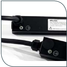
Top or front power cords available.

Distribution of power inside a data centre environment where a variety of different power connectors are required.