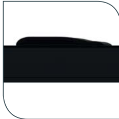
Ultra low profile design