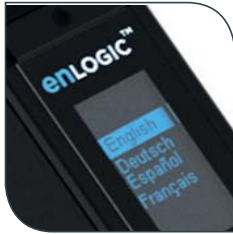
Large and easy-to-view OLED display