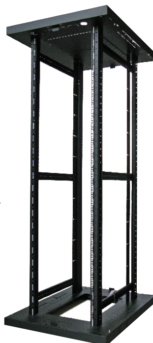
Frame only shown. Accessories can be purchased separately.