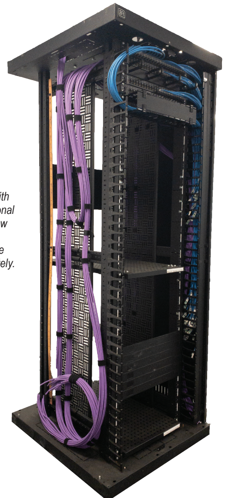
Frame is staged with cabling and additional accessories to show in-use application. Accessories can be purchased separately.