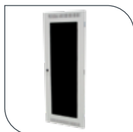
Glazed acrylic door

Not all accessories are listed. For more information on the range of accessories available please visit www.brenclosures.com.au/ETSI_racks.htm