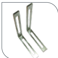
Bracket NGN (pair)