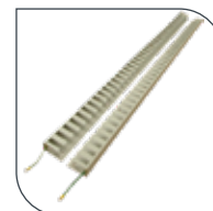
Cable management duct