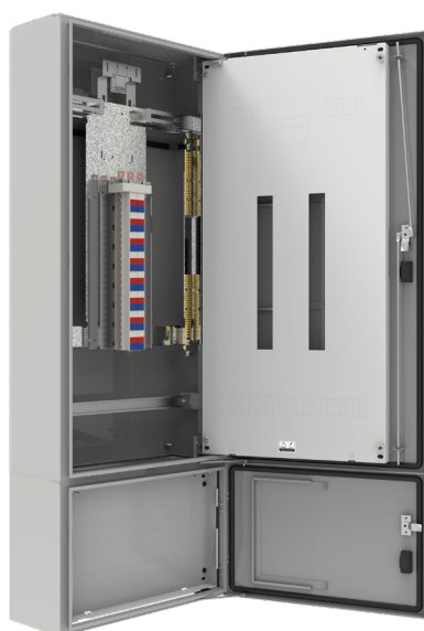
PBSEXT can be fitted to top or bottom