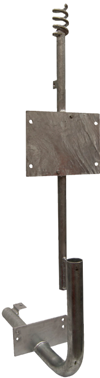
RB01/3 with RB/AP3 attached