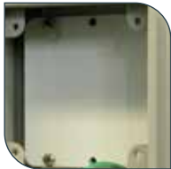
Metal mounting pan