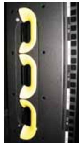
Fibre Radius Guide Kit - 3 Way